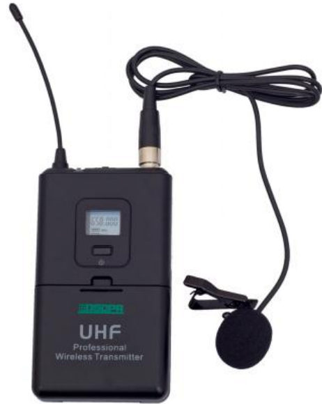
Collar Mic D5812