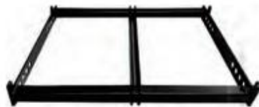
LA1420D Installation Bracket