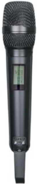
Handheld Mic D5811