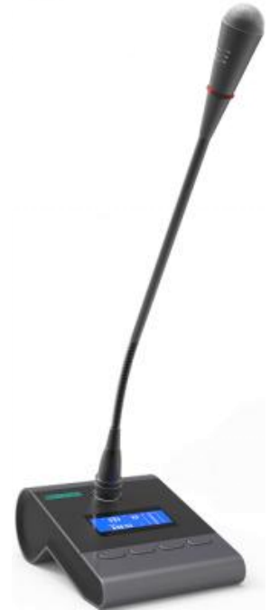
Desktop Mic D5811