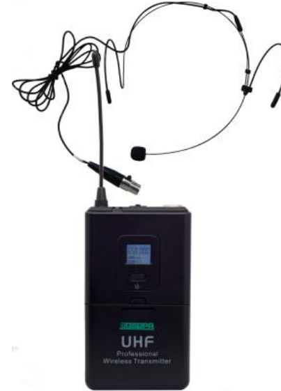
Headset Mic D5813