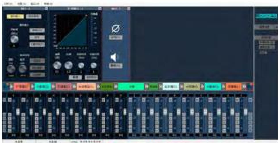
System Set-up Via Computer