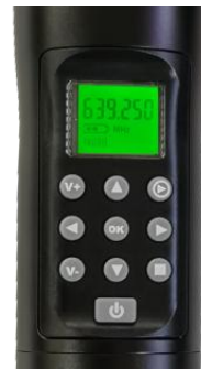
Handheld Mic With Remote Control D5811R